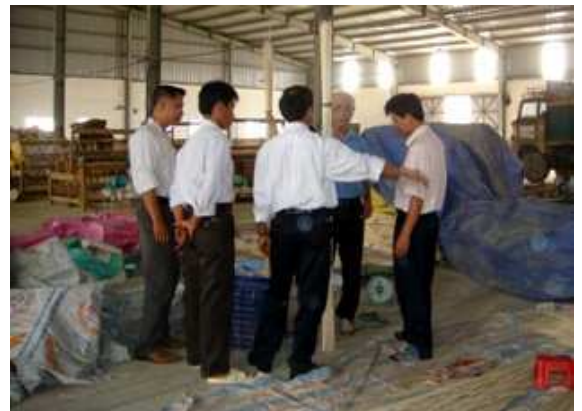
Visit to Duong Thanh Phu , a typical bamboo company

Hadeva made significant progress in promoting the development of the bamboo sector in Yen Bai and Phu Tho provinces with activities such as training in bamboo sustainable management and inter-cropping for farmers, linking bamboo farmers to processors, supporting bamboo businesses on market and technology information and new product development.