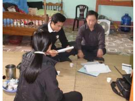
An interview with a household in Quan Hoa district

The follow up survey will follow a similar format and is visiting the