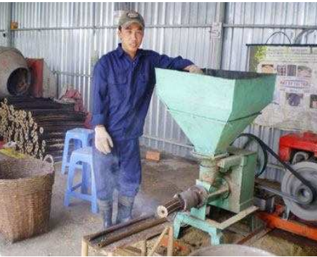
The machine that produces pellets from rice husks in the Mekong Delta

The Mekong Bamboo team and its partners are helping bamboo processors to pilot new machinery to convert waste into sawdust. The idea was inspired by a similar machine to convert rice husk to pellets in the Mekong Delta (see picture).