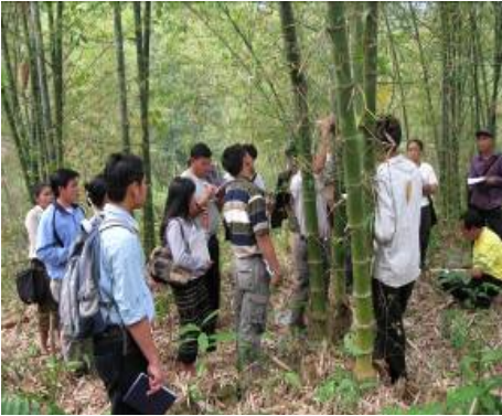
Study-tour to Thanh Hoa

With the aim of connecting the bamboo sector in Houaphanh province (Lao PDR) to the more developed bamboo industry in Thanh Hoa province (Vietnam), Mekong Bamboo