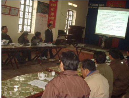
Business Linkage Development Workshop in Phu Tho & Yen Bai

of Prosperity Initiative's Vietnamese partners, to facilitate the signing of MOUs between 5 pre-processing workshops with 8 farmers groups that practice bamboo marking in Yen Bai and Phu Tho. As committed in